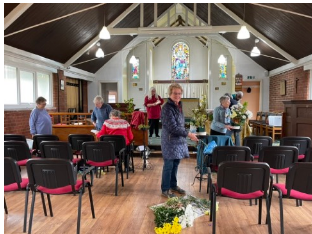
Saturday - preparations for Easter Day at St Luke's