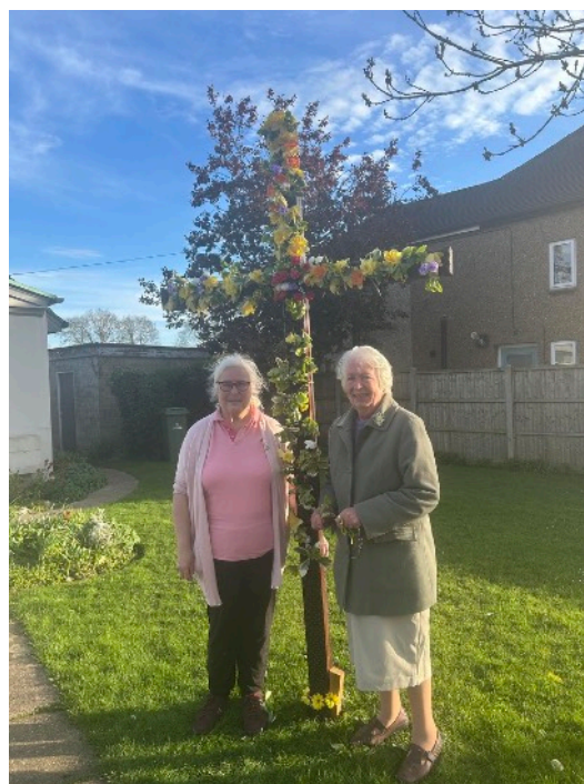
Easter Eve - after the Service of Light the Cross of Flowers ready for contributions from the Easter congregation