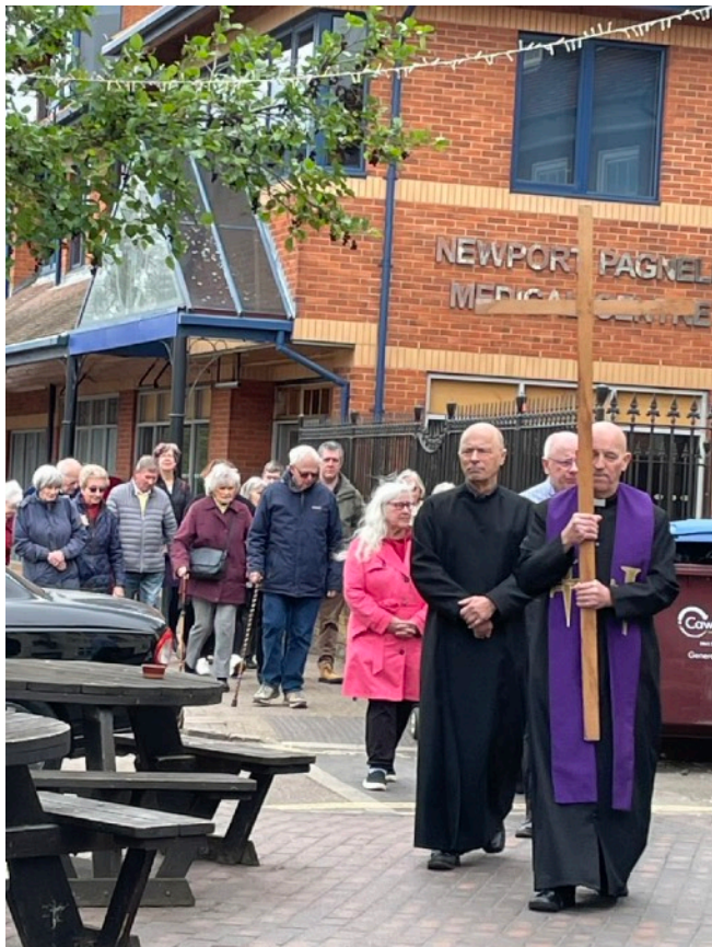
Good Friday Walk of Witness down the High Street to St Peter & St Paul